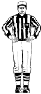
Offside, encroachment, or neutral zone infraction (Hands on hips.)