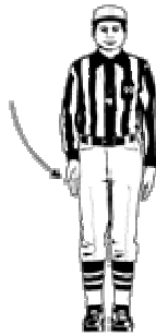
Illegal crackback (Strike of an open right hand against the right mid-thigh preceded by personal foul signal.)