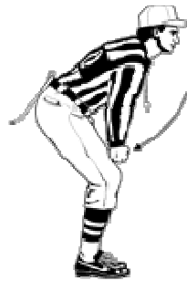
Illegal cut (Hand striking front of thigh.)