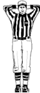
Loss of down (Both hands held behind head.)