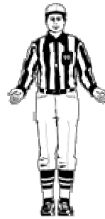
Interlocking interference, pushing, or helping runner (Pushing movement of hands to front with arms downward.)